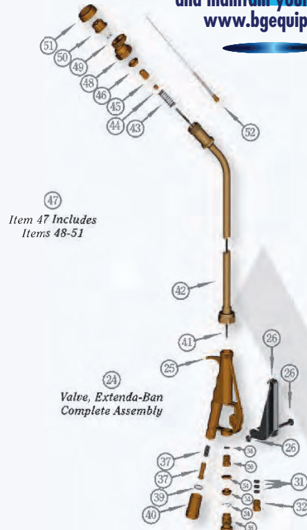
Item 47 Includes Items 48-51