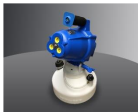
Sanosil Easy Fog